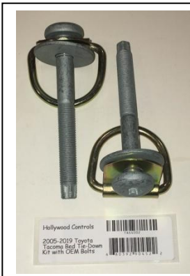
Figure 1 TA64002 KIT