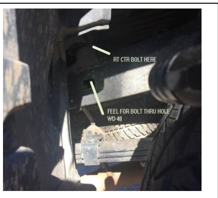
Figure 6 Right Center Bolt Lube Location