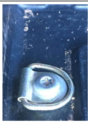
Figure 3 Left Front Install