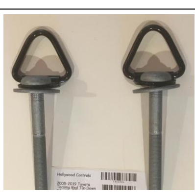
Figure 7 TA64004 KIT