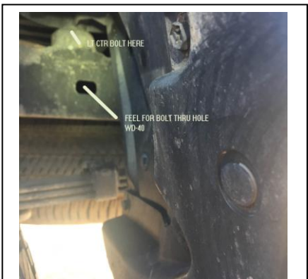
Figure 5 Left Center Bolt Lube Location