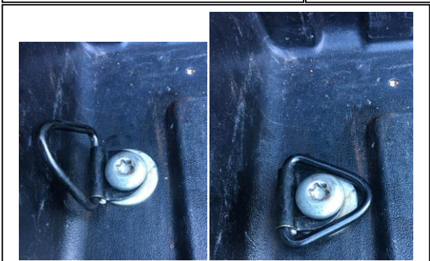
Figure 8 Mounted Front Left