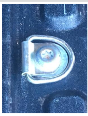
Figure 2 Left Center Install